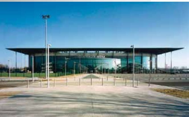
From left to right: Volkswagen Academy Sales & Service, Wolfsburg MobileLifeCampus, Wolfsburg Volkswagen Arena, Wolfsburg